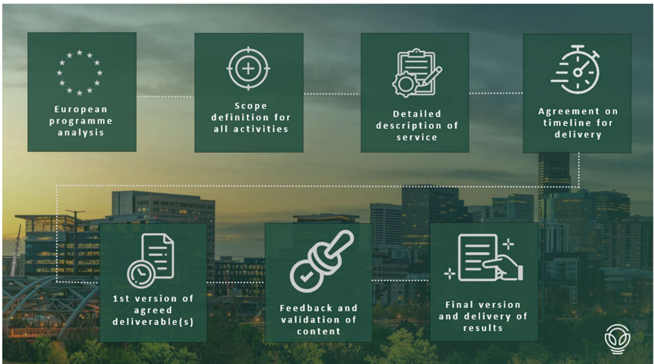
Figure 1: Implementation Plan and roadmap.

The following roadmap outlines the strategic framework and actionable steps to effectively implement our solutions. Within this implementation plan, we outline a detailed roadmap, guiding you through the sequential phases essential for the project's success: